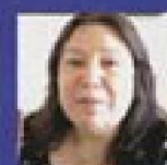
Crystal Sinclair Indigenous Mobilization Unit