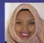
Gilary Massa National Council of Canadian Muslims